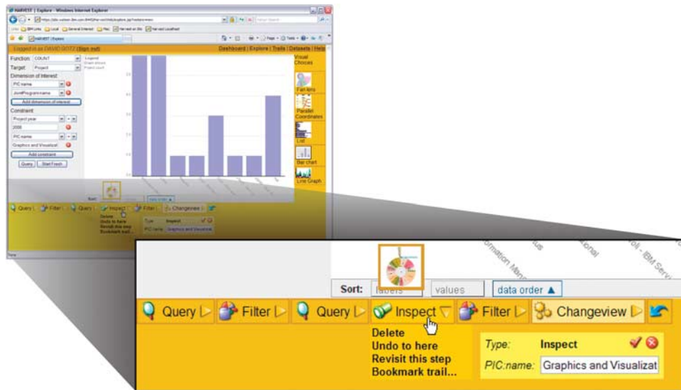
Figure 3: Action trails in HARVEST allow users to preserve their inquiry paths. 24

events, actions, subtasks and tasks to categorize a user's activity. 24 In HARVEST, a visualization state can be saved together with the 'action trail' (Figure 3) that constitutes its provenance. These actions are composed of exploration actions (those involved in accessing and exploring data), insight actions (those involved in marking visual objects or taking notes) and meta actions (those that operate over the action trail itself, such as undo and redo). The authors of HARVEST discuss examples of third-party visualization tools being mapped to this provenance schema, suggesting that it may be possible to distill interaction with any visualization into a set of user-activity building blocks.