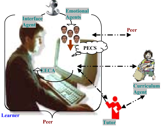
Figure 1: EMASPEL architecture

The figure1 illustrates the architecture of a peer in our P2P e-learning system. In order to promote a more dynamic and flexible communication between the learner and the system, we integrate five kind of agent: