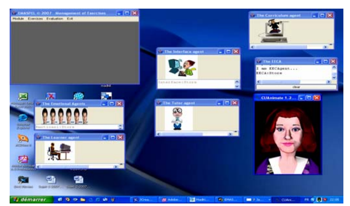
Figure 4 : EMASPEL Framework

We programmed agents used in the EMASPEL Framework (figure 4) with the MadKit (Ferber and Gutknecht 1998) Platform. MadKit is a modular and scalable multi-agents platform written in Java and built upon the AGR (Agent/Group/Role) organisational model: agents are situated in groups and play roles. MadKit allows high heterogeneity in agent architectures and communication languages and various customisations. In fact, MadKit does not enforce any consideration about the internal structure of agents, thus allowing to a developer to freely implement his own agent architecture. Communication among agents is implemented by a set of communication primitives, which is a subset of FIPA-ACL (FIPA 2004), extended with specific primitives. We used the JXTA Framework (Gong 2002) to build an open source p2p network.