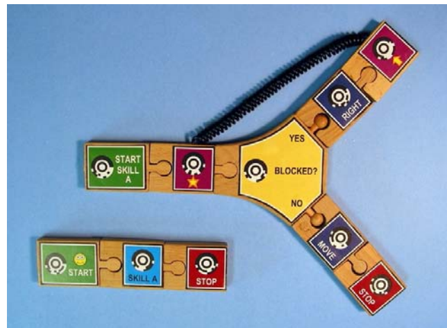
figure 5. This program includes a conditional branch, a loop (represented by coiled wire), and a subroutine.

right first. Special JUMP and LAND statements allow the introduction of loops into a program's flow-of-control. These statements are connected by coiled wire that represents the flow of execution as it moves from the JUMP statement to the LAND statement. This construction is similar to a GOTO statement in a text-based language. Tern also offers structured loops that provide more controlled iteration. Like Karel the Robot, Tern includes the ability to create subroutines called Skills . Skills can be defined using a START SKILL block and can be invoked using a skill action block (see figure 5).