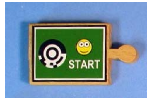
figure 4. START statements can only be connected at the beginning of a flow-of-control chain because they have no incoming jigsaw puzzle connector.

In the design of Tern we sought to minimize the possibility of creating programs with syntax errors. The shape of the blocks provides a physical constraint system that prevents many invalid language constructions from being assembled as physical constructions. For example, it is impossible to connect a STOP statement in the middle of a flow-of-control chain. It can only be attached at the end because it lacks an outgoing jigsaw puzzle connector. In a similar way, START statements can only be connected at the beginning of flow-of-control chains. Some syntax errors are still possible—leaving one statement disconnected from the others in a program is an example. When a syntax error occurs, the compiler displays a picture of the original program, an error message, and an arrow indicating the location of the problem.