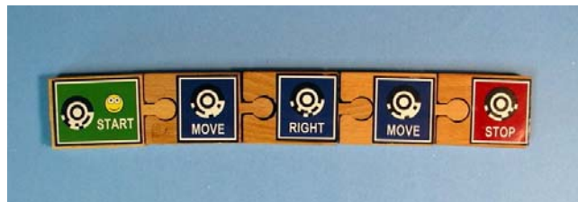
figure 3. A simple Tern program that moves a robot forward one square, turns it right, and then moves it forward again.

Simple Tern programs start with a START statement and end with a STOP statement. For example, the program in figure 3 starts a robot, moves it forward one square, turns it right, and then moves it forward again.