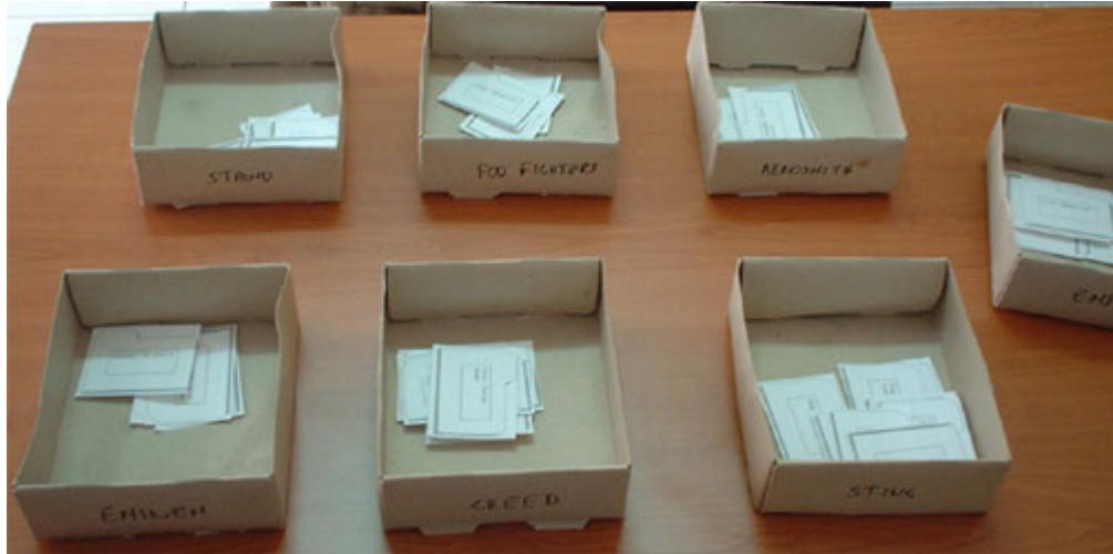
Figure 2 The Tangible User Interface case

The identifiability measure provides the scores shown in table x for the two conditions of the task.