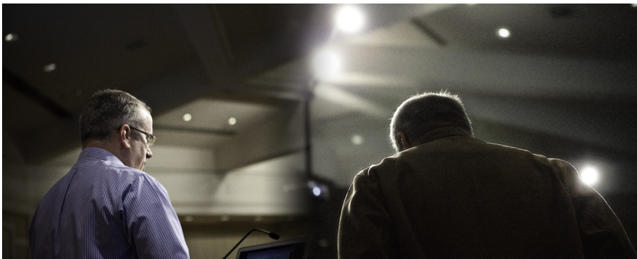
Fig. 49. Brendan Eich and Allen Wirfs-Brock, 2011.