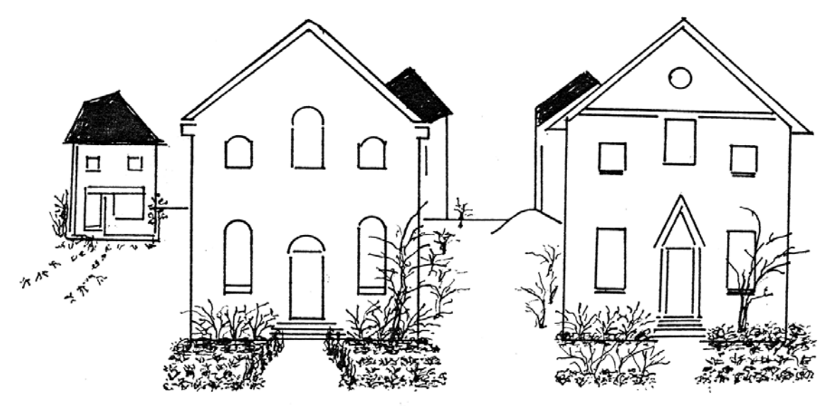
A landscape that looks right now...just planted.

Over the past few years, I have been called upon to consult at several relatively new landscape projects. The first one, a planned mixed-use residential community, had quite a nice plant palette. It was a mix of sturdy groundcovers, deciduous and evergreen, drought-tolerant shrubs, some natives, good trees, and a few not-too-onerous ornamental grasses and perennials. Although the beds were roomy, the plants were all crowded next to the edges, where they