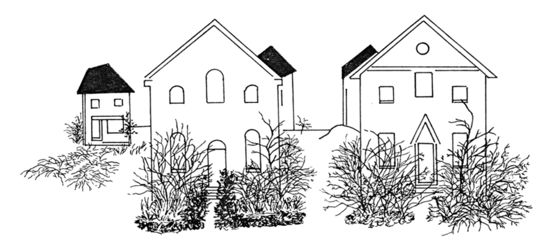
Planting Goes Very Wrong in 3-5 Years—Pruning Won't Help

would, and did, interfere with foot traffic, signage, and parked cars. The result was that the landscape crew was forced to shear the shrubs. What really killed me was that this landscape design actually won awards. My only explanation is that perhaps a well-meaning installation crew mis-sited the shrubs in an attempt to make it look finished now . The same plants and numbers of plants, if correctly spaced and sited, would last for thirty years, as all good landscapes should. I wound up telling the crew that they would have to dig up and rearrange almost all the existing plants in the fall and winter. Given tight maintenance budgets, what are the chances that will happen?